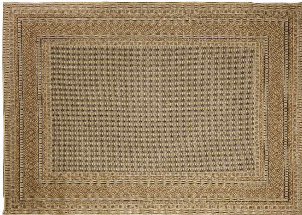
Monterey Diamond Border Natural