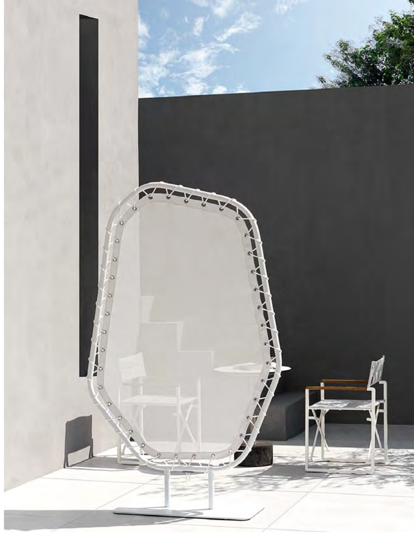
ARO Divider Model A-Sling