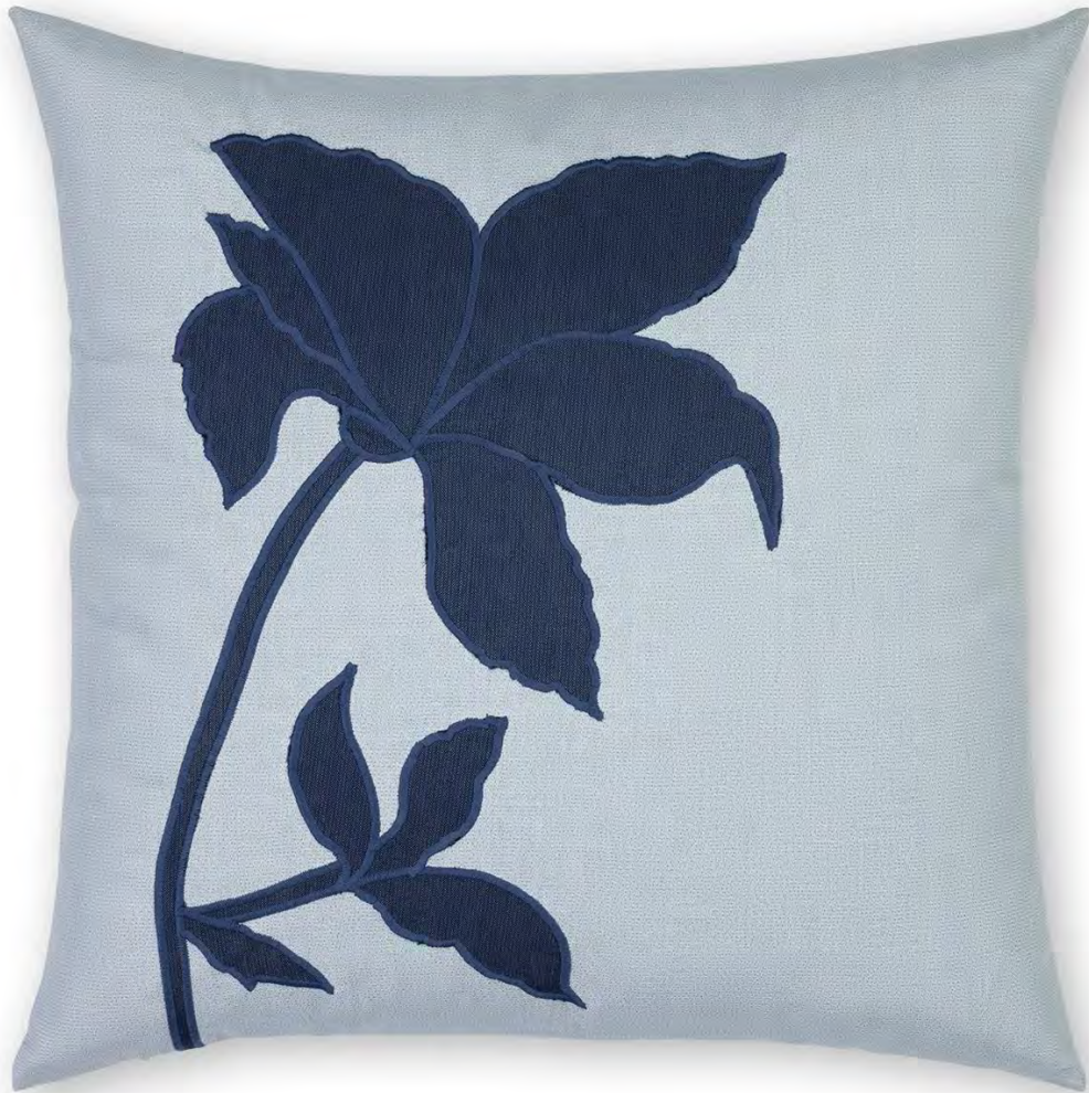
Botanica Lily Pillow