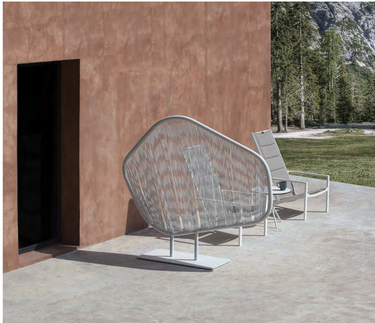
ARO Divider Model B-Rope Weave