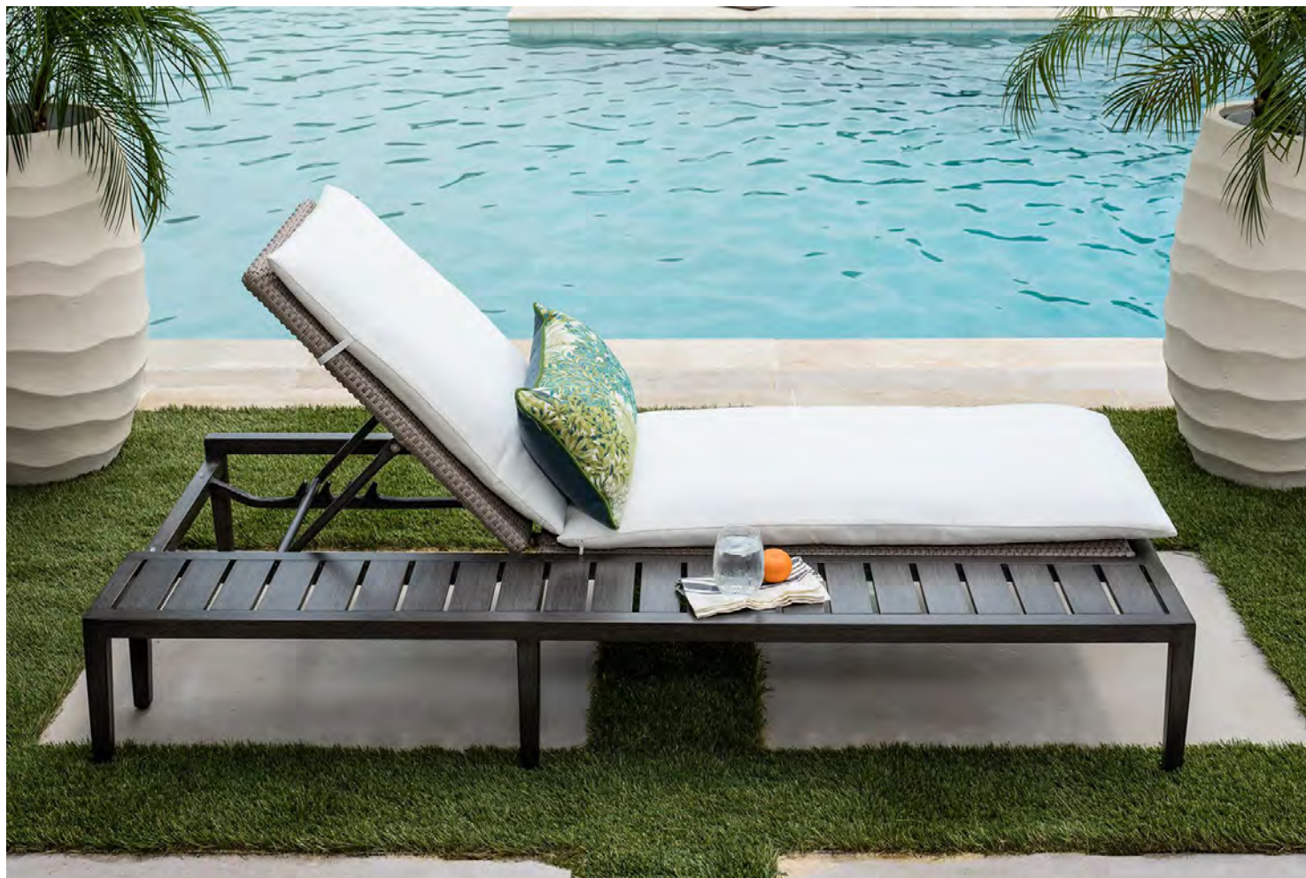
Harbor Chaise Lounge