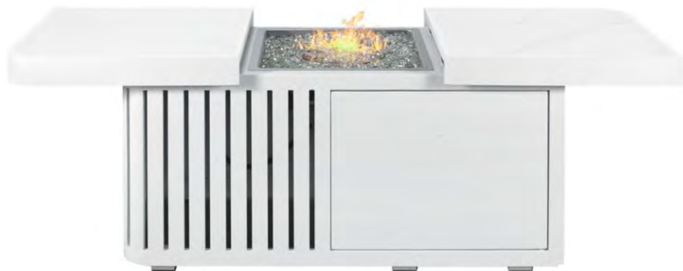
Sintered Stone & Vertical Slat Base Fire Pit