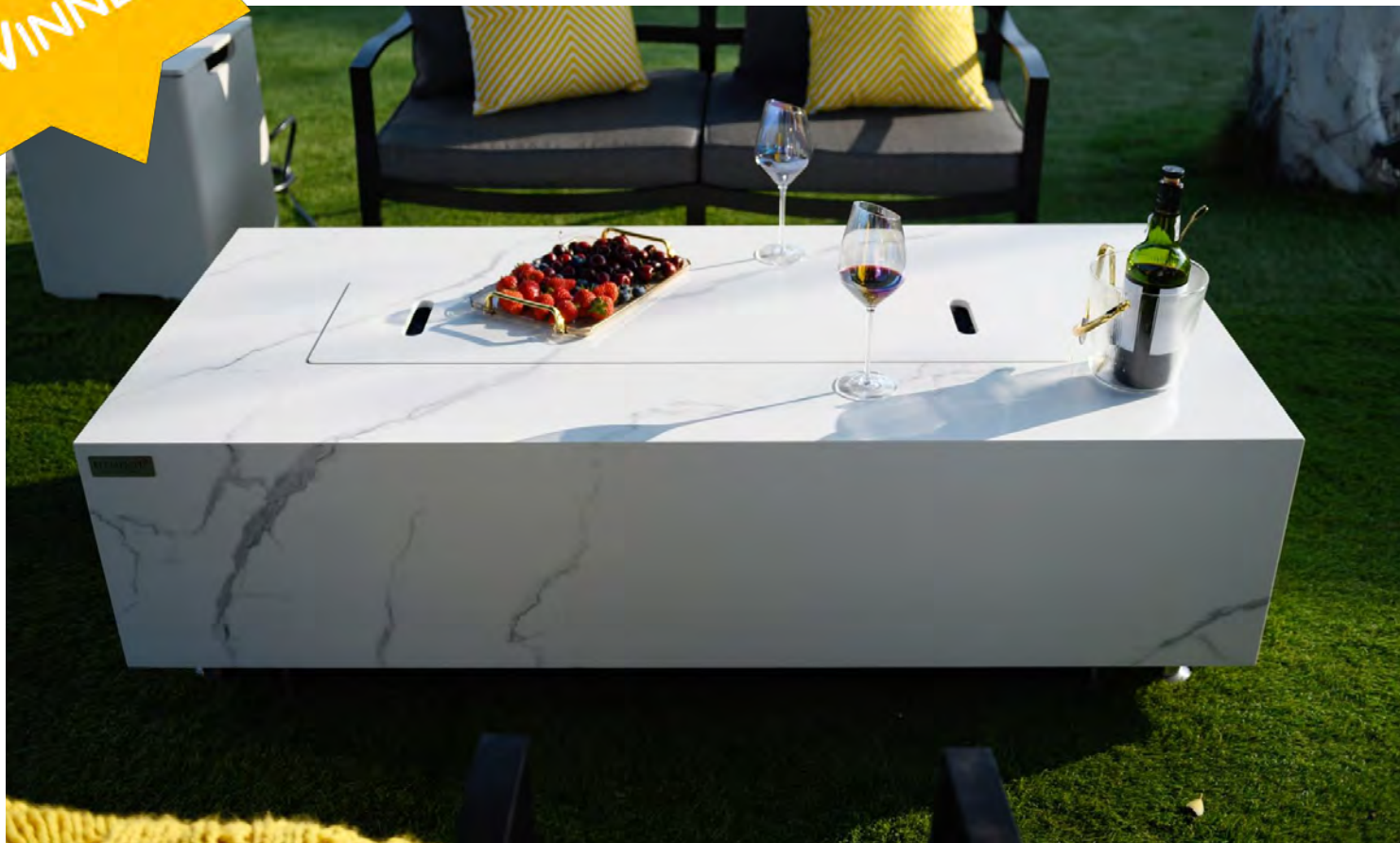
Carrara Marble Porcelain Fire Table