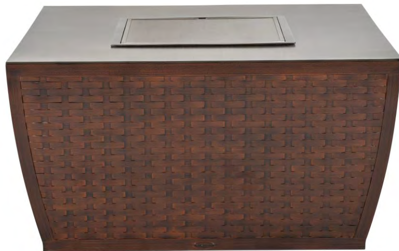
Largo Fire Pit